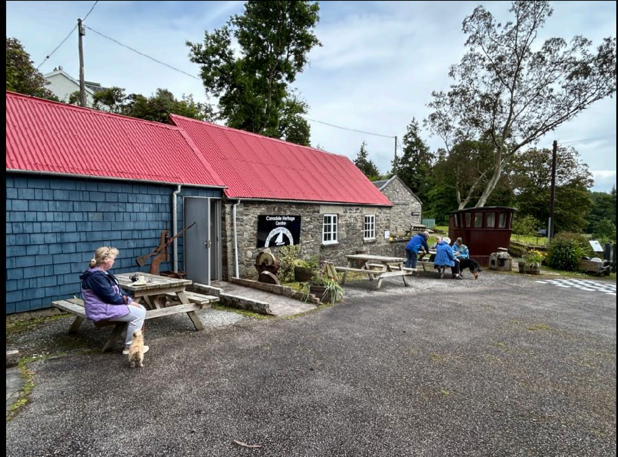
Heritage Centre, Carradale