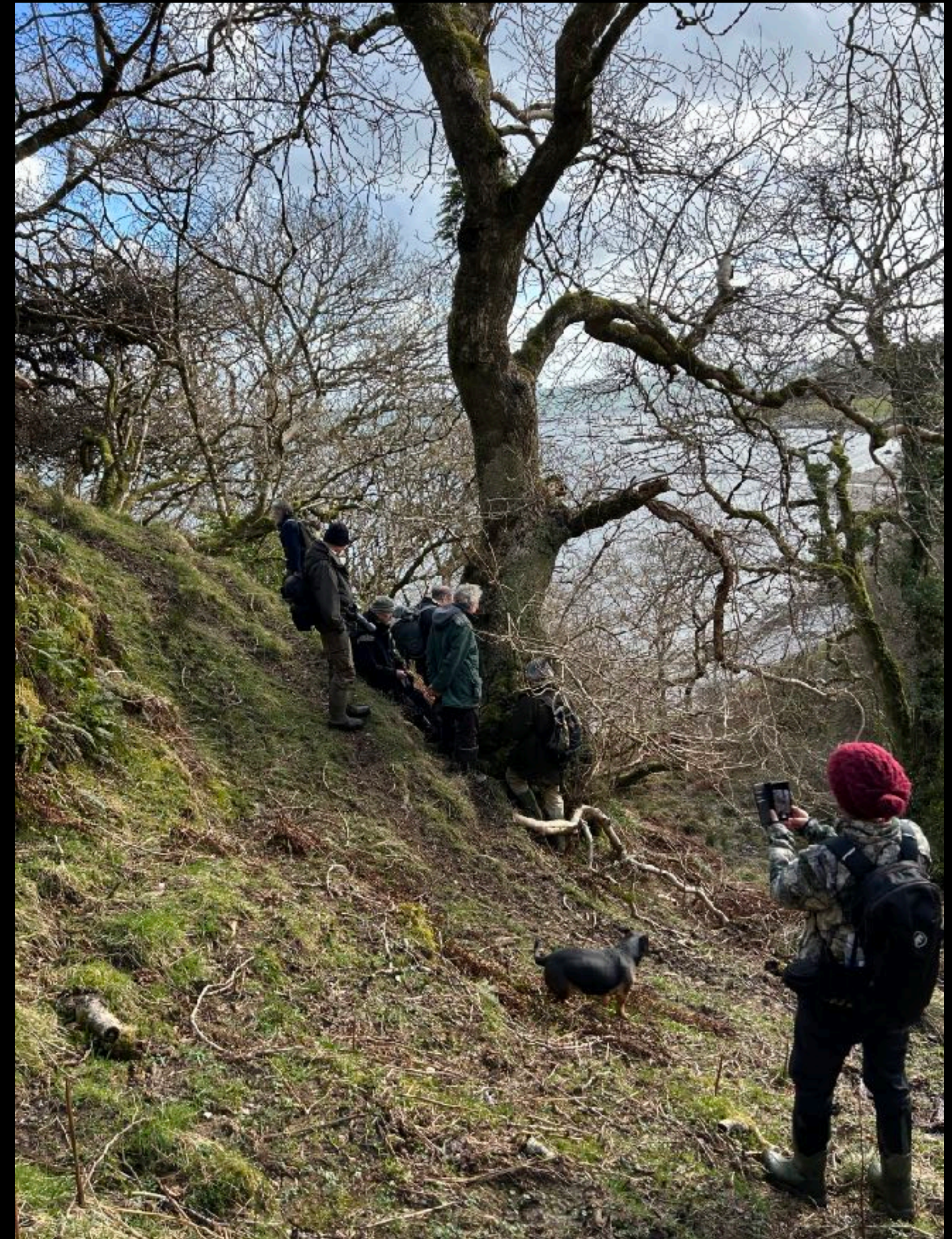
Community and Experts coming together to explore the biodiversity of Torrisdale SSSI