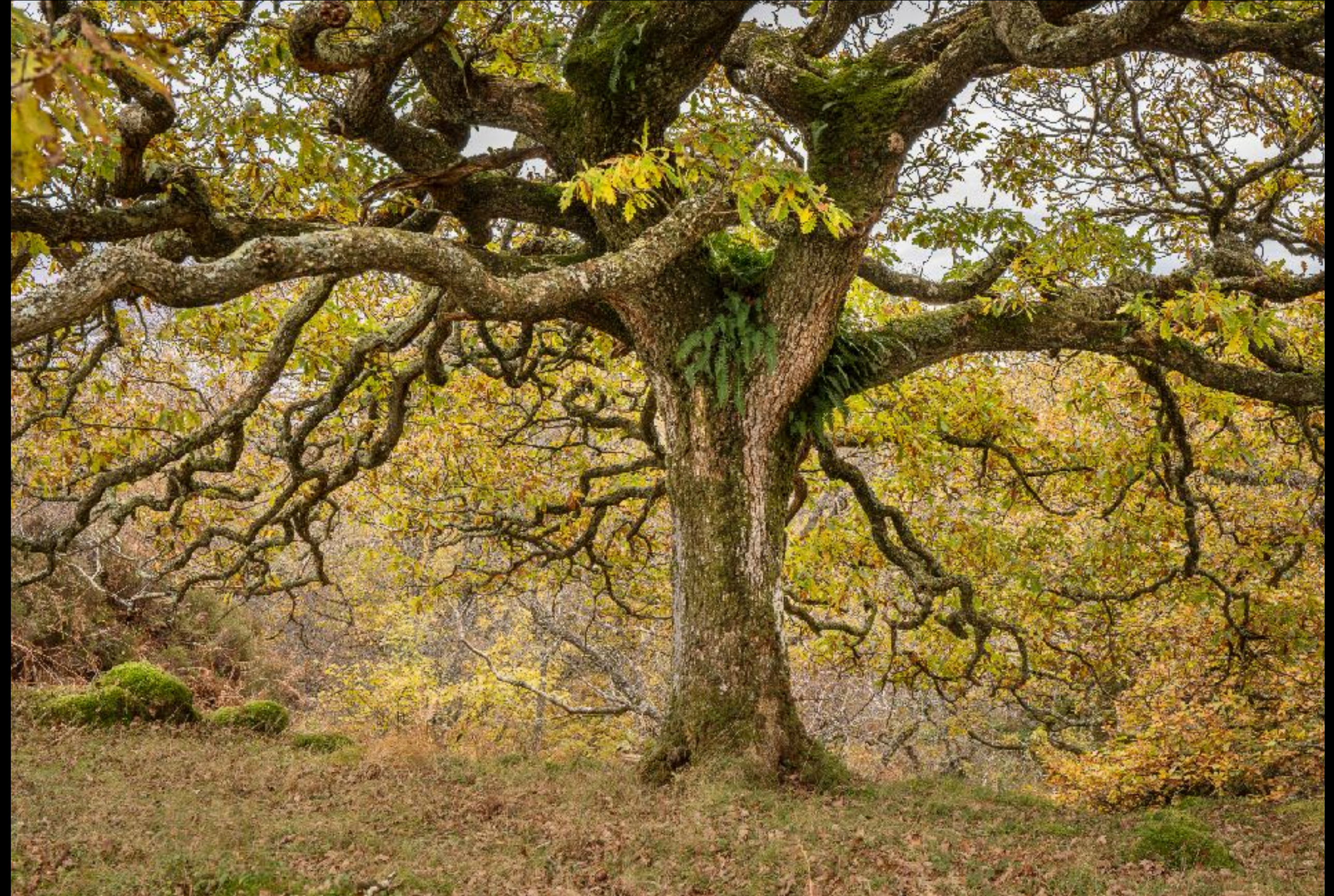
Ancient Oak Tree Clonaig Woods

To enlist this groups support to actively engage with, support and promote the work of Kintyre Rainforest Alliance.